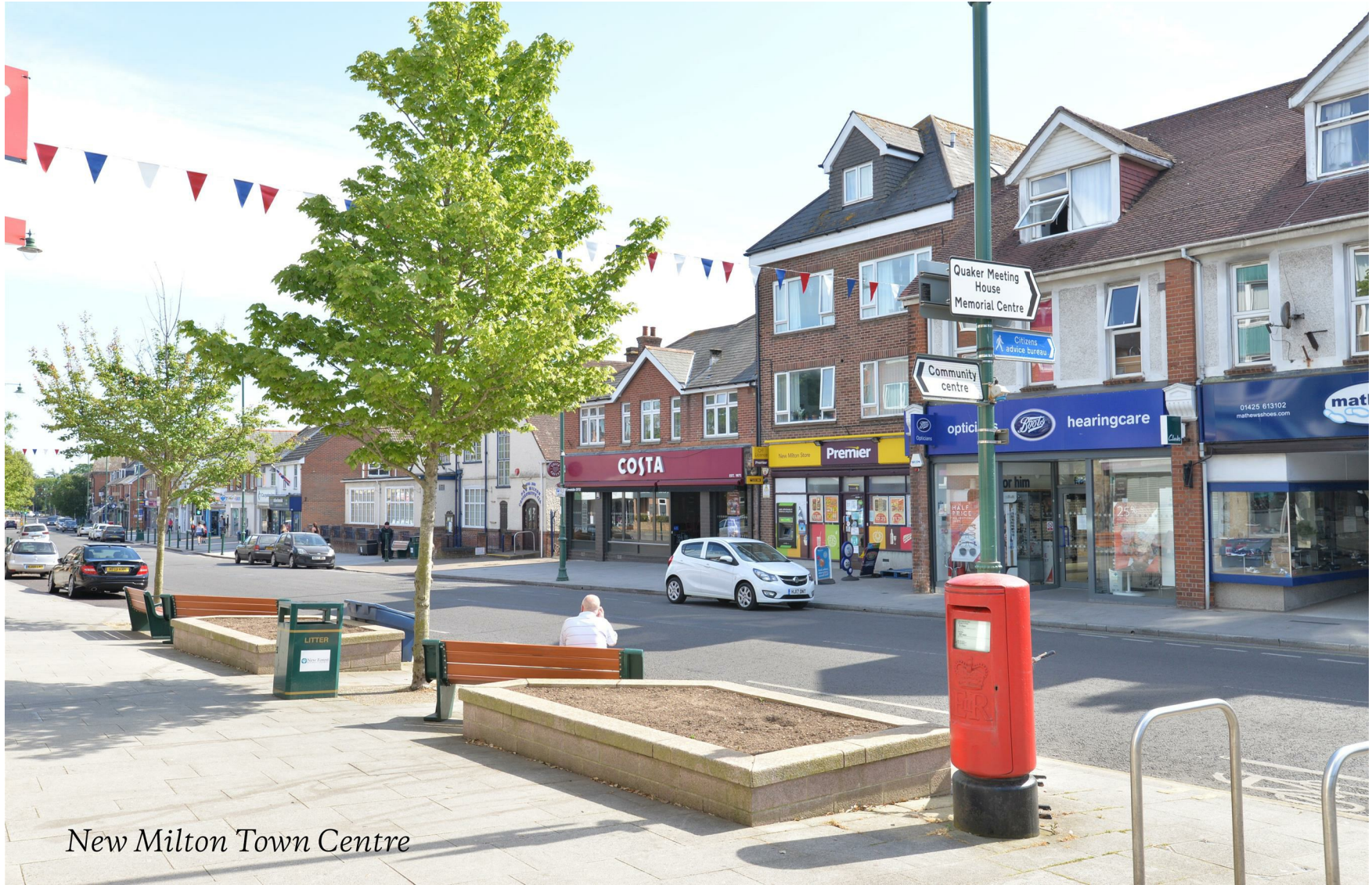
New Milton Town Centre

Mitchells.uk.com info@mitchells.uk.com 01425 616411