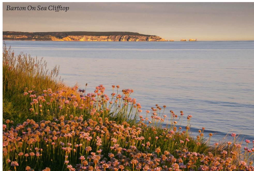
Barton On Sea Clifftop

Total area: approx. 5.3 sq. metres (57.3 sq. feet)