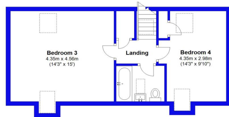
Illustration for identification purposes only; measurements are approximate, not to scale. EPC New Forest Plan produced using PlanUp.