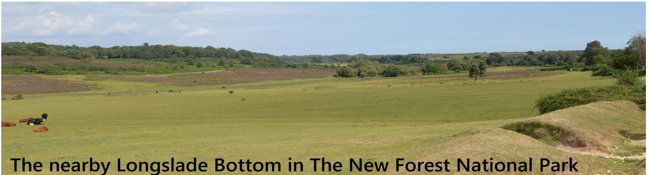
The nearby Longslade Bottom in The New Forest National Park