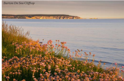
Barton On Sea Clifftop