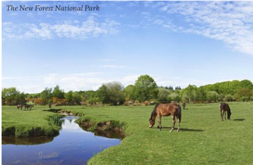
The New Forest National Park