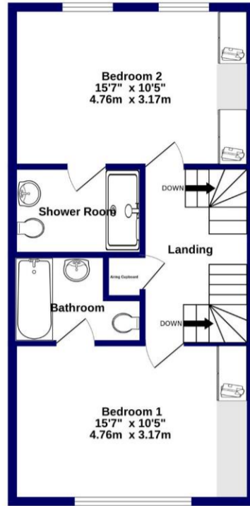
1ST FLOOR 503 sq.ft. (46.8 sq.m.) approx.